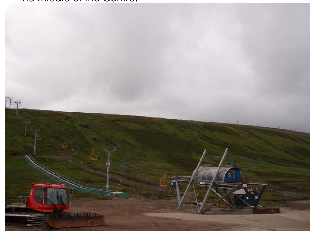
Fig. 2. Existing chairlift and site of proposed trails

1. The Lecht Ski Centre is located on the A939 Cockbridge to Tomintoul Road approximately 9km to the south east of Tomintoul. The Centre consists of ski tows, including a chairlift, and ski runs either side of the valley, car parking areas either side of the main Centre building, a house for the on-site manager, and some workshop accommodation. The A939 passes through the middle of the Centre.