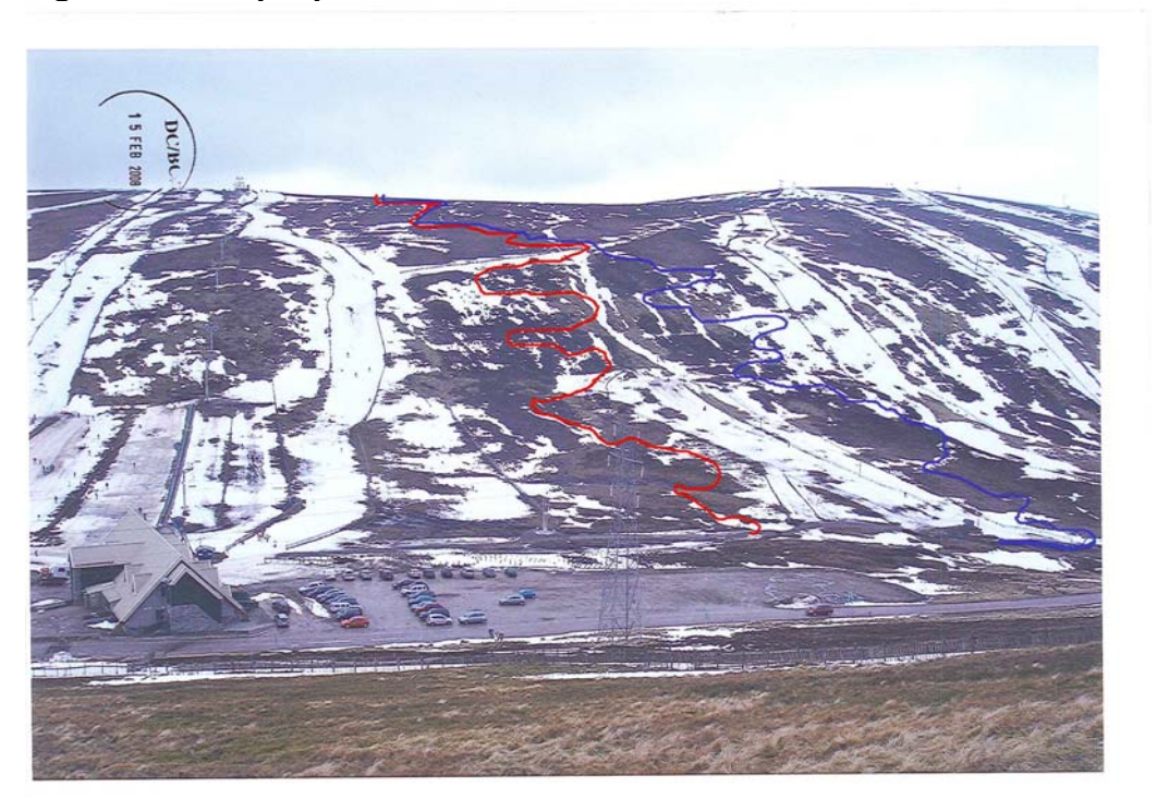
Fig. 6. Photomontage showing proposed trail routes