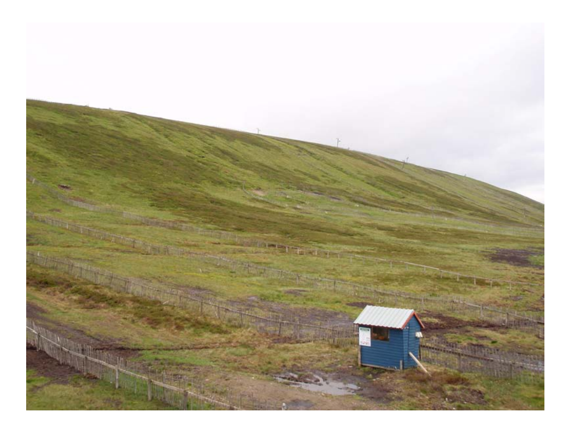
Fig. 3. Site of proposed trails

bomb-holes) depending on the grade of difficulty of the trail. The trails end at the bottom of the slope, and join an existing surfaced track which runs back towards the chairlift.